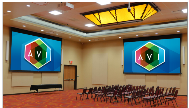
4 Bears refurbished and converted its old event center into a 400-seat ballroom for Super Bowl events, corporate parties and more.