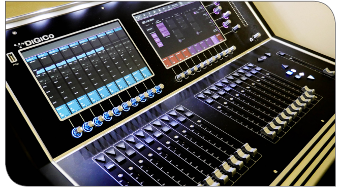
DiGiCo Mixing Consoles are used for live sound, broadcast and theater applications.