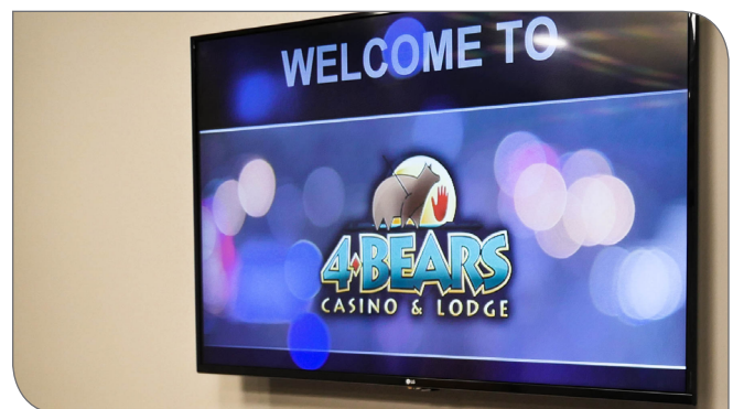
AVI Systems mounted various video displays for digital signage solutions, and more.

4 Bears wanted to have the capability to host different events, so the event center would need to be able to host anything from a basketball game to a live concert. And, it had to be easy enough so that configurations could be completed from night to night.