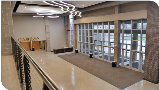
Above: Inside the front entrance of the 4 Bears Casino and Lodge Event Center.

The number “2020” surfaced as a part of the future vision of the casino and event center.