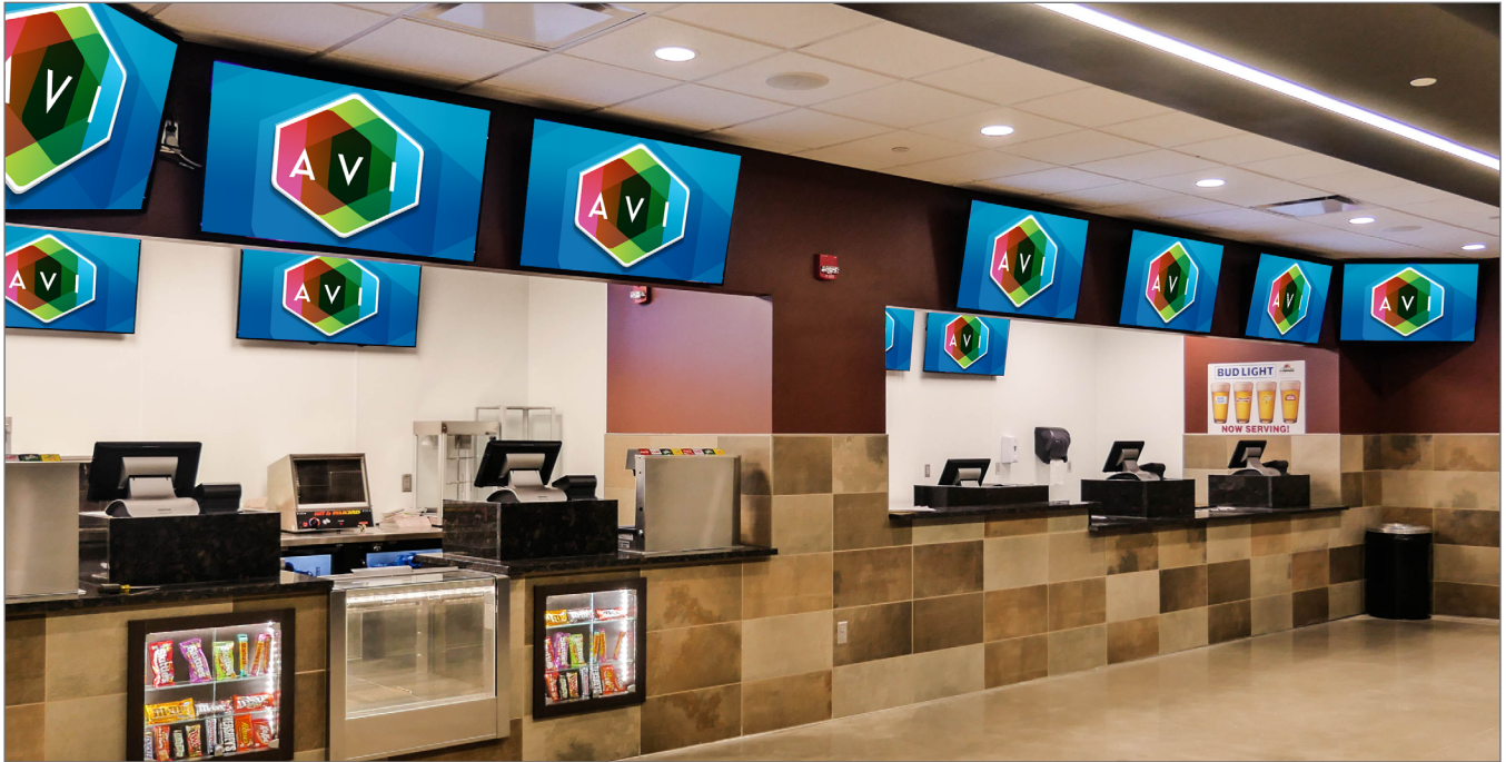
Numerous monitors were mounted in the concessions area to display food and beverage options.