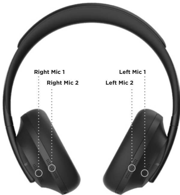
Dual beamforming voice microphone array

Speak confidently and be heard clearly on conference calls — an adaptive four-microphone system isolates your voice from surrounding noise, eliminating the mute/unmute shuffle and “... are you there?” struggle