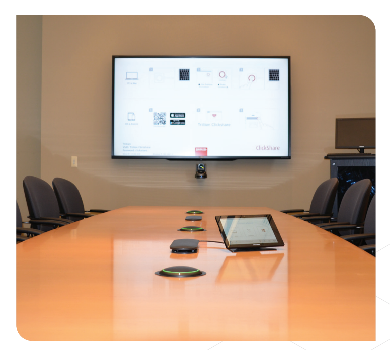
The small meeting room features a 90-inch display for easy viewing.

STEPHANIE BURKETT, MARKETING MANAGER, COPAKEN BROOKS