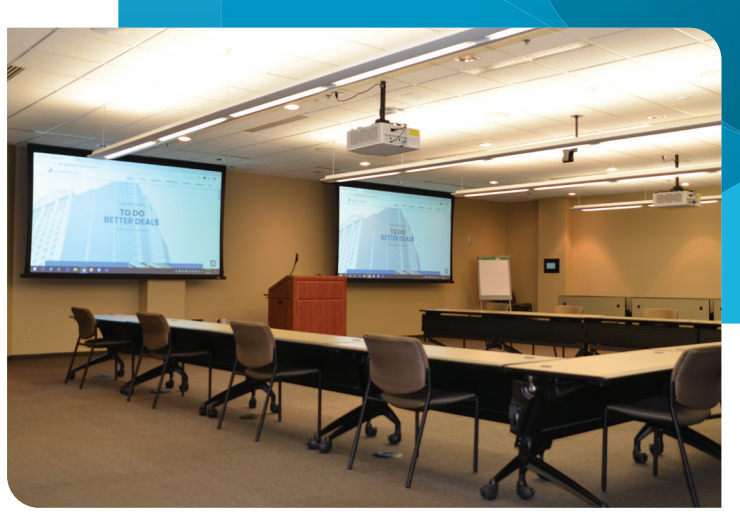
Large conference room designed to accommodate up to 225 people.