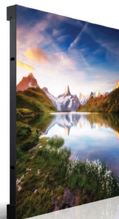
Samsung IF Series LED Panel

"I thought of Samsung technology as soon as I saw the wall proportions and curvature," said Burkett. "Then I involved two AVI Systems' partners who helped make this video wall a reality. Premier Mounts and Ion Visual Solutions played instrumental roles to ensure the Samsung display wall fit the environment.