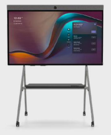
Neat Board (with floor stand)

Connecting with people at the office when working from home is vital for fostering a healthy company culture and maintaining well-being. Chance encounters like catching up with a colleague while they grab a coffee or quickly exchanging ideas over lunch help everyone feel included.