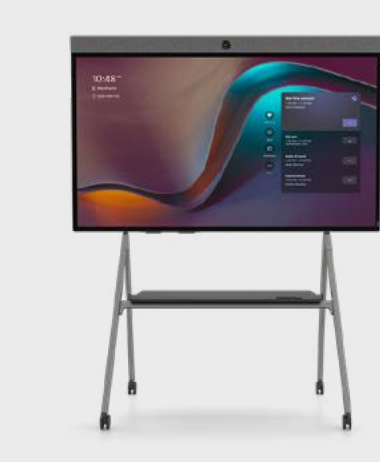
Neat Board (with floor stand)

Open offices provide employees with work and social areas, inspiring spontaneous meetups, collaborative sessions and agile team exercises. They also prompt personal workspaces reservable via hot desking for ad-hoc syncs with remote colleagues at your desk.