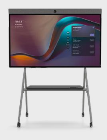
Neat Board (with floor stand)